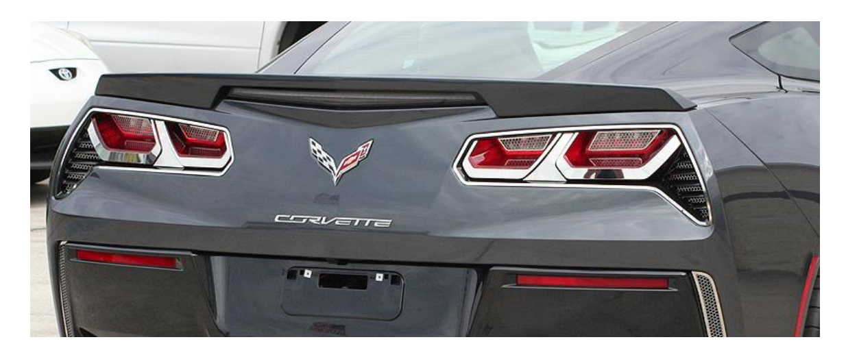
Thank you and enjoy your purchase!

If any questions occur during installation, please contact AMERICAN CAR CRAFT 18924 SAKERA ROAD-HUDSON FLORIDA 34667 Phone # 727-861-1500 Fax # 727-861-1520