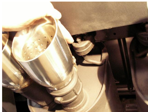
2008 NPP EXHAUST

The 2008 corvette outfitted with the NPP exhaust system utilizes the prior years Z06 vacuum actuated muffler and tips mated to a newly designed manifold/cat system that is ½ to ¾ longer. As a result the NNP configuration forces the system to sit slightly lower then the previous years Z06. In order to install the ACC stainless steel exhaust port filler panel both the all stainless design as well as the newer heavier perforated design and the laser cut design, Special adjustment instructions must be performed. What these instructions will explain is how to easily reposition the muffler and tip system to allow the panel to fit. Currently these instructions have been 100% successful and are as follows.