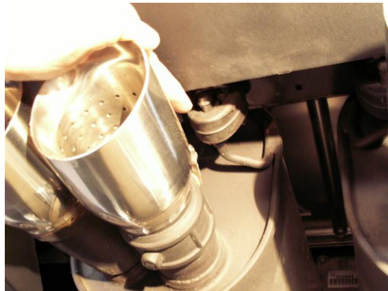
2008 NPP EXHAUST

The 2008 corvette outfitted with the NPP exhaust system utilizes the prior years Z06 vacuum actuated muffler and tips mated to a newly designed manifold/cat system that is ½ to ¾ longer. As a result the NNP configuration forces the system to sit slightly lower then the previous years Z06. In order to install the ACC stainless steel exhaust port filler panel both the all stainless design as well as the newer heavier perforated design and the laser cut design, Special adjustment instructions must be performed. What these instructions will explain is how to easily reposition the muffler and tip system to allow the panel to fit. Currently these instructions have been 100% successful and are as follows.