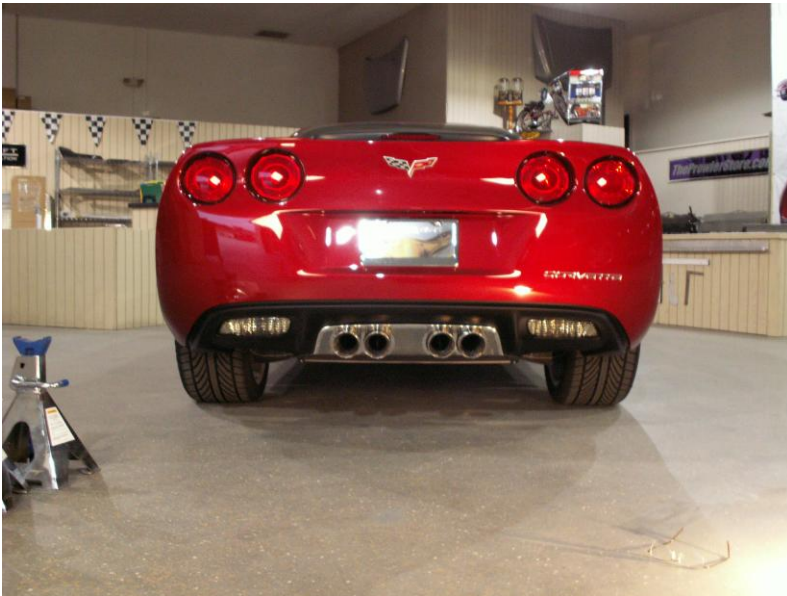
2008 NPP EXHAUST