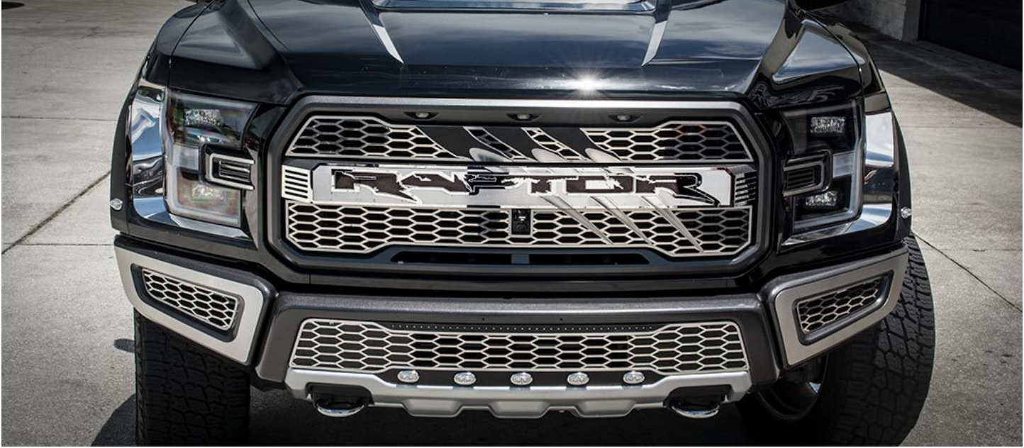
PARTS INCLUDED: 1-Front Raptor Logo Slash Center Grille 1-Adhesive Promoter Pack

Introduction: In the next few paragraphs we will explain to you what you will need to know and do for a successful application of ACC Stainless Steel Accessories. It is important to understand that almost all stainless steel peel and stick accessories need to be pre shaped by hand in order to achieve a nice long term installation. We realize that all parts are different from each other but as far as the installations of these parts they all will need to follow the same set of general instructions.